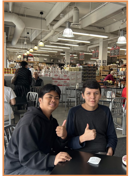
Right: Foods 10 field trip to Edmonton. Students visited the Italian Center, T & T Supermarket, Siam Thai restaurant, and the Two Hills Mexican Store.