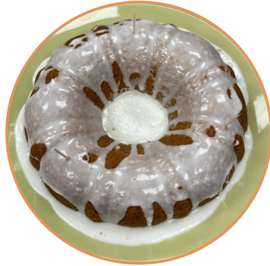
Above: Tasty creations from the Foods Room.